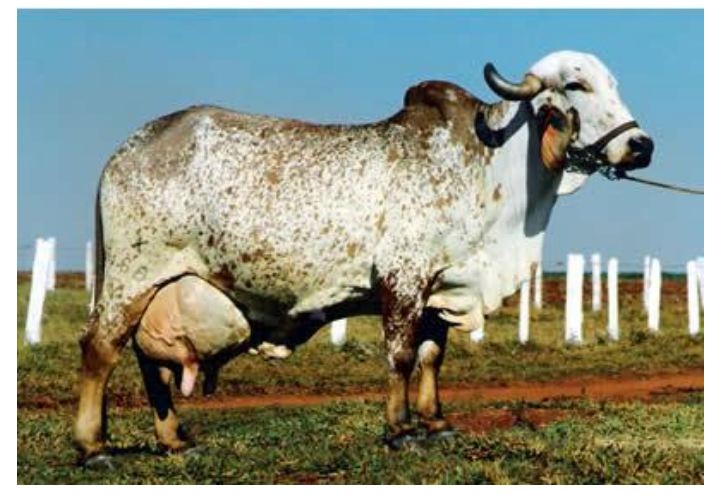
DAUGHTER: previous WR cow Ø 48.0 ltrs/day