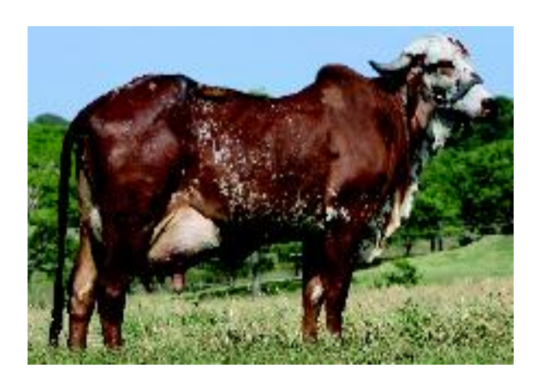
DAUGHTER: present WR heifer Ø 49.4 ltrs/day