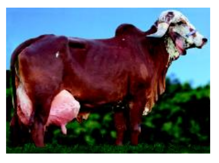
DAUGHTER: present WR cow Ø 52.8 ltrs/day