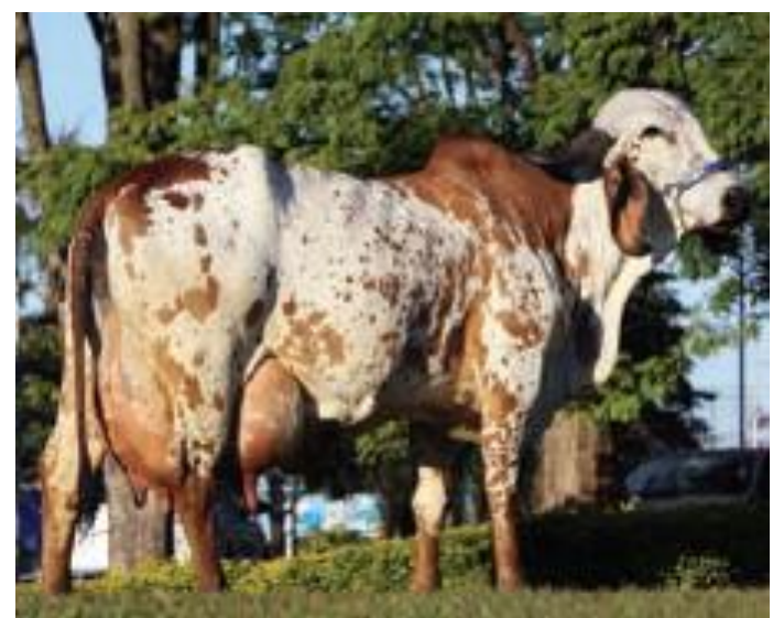
WR stands for World Record. All production records indicated are lactation averages!